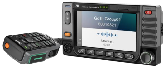
Handheld Digital Trunking Terminal for PTT (Push-To-Talk)

Object of the declaration GM651, Broadband Digital Trunking Terminal, ZTE;