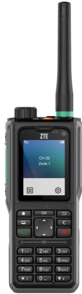
Handheld Digital Trunking Terminal for PTT (Push-To-Talk)

Object of the declaration GH651, Broadband Digital Trunking Terminal, ZTE;