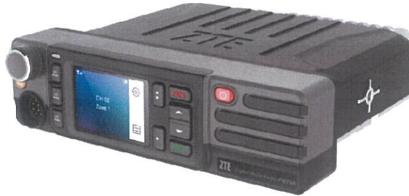
DIGITAL MOBILE RADIO

Object of the declaration PM790 U(1), DIGITAL MOBILE RADIO RADIO, Caltta.